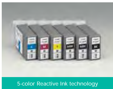
5-color Reactive Ink technology