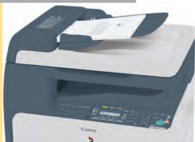
Duplexing Automatic Document Feeder