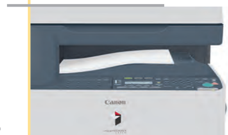
Integrated Output Tray

Plug-and-play connectivity is provided via a standard USB 2.0 Hi-Speed interface for optimal performance. Best of all, each model can be fully networked so you can extend system capabilities to multiple users (optional for the Canon imageRUNNER 1025 model).