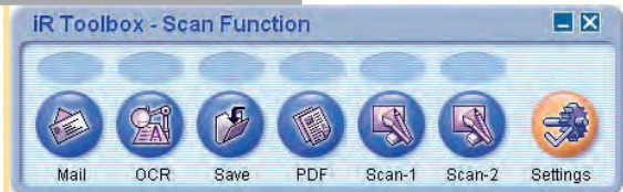
iR Toolbox Menu

The imageRUNNER 1025 Series models are easy to manage and maintain as well. The embedded Department ID Mode tracks and limits system access to those users assigned valid IDs and passwords. In addition, device management utilities, including a browser-based Remote User Interface (UI), provide real-time monitoring and status information, while high-yielding supplies and consumables help keep operating costs to a minimum. Even more, as an ENERGY STAR® qualified system, the imageRUNNER 1025 Series models are designed with the environment in mind.