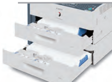
Expandable Paper Supply